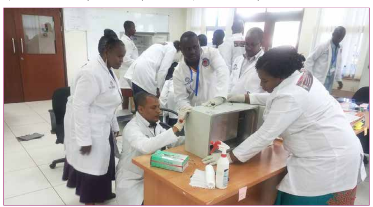
Regional Training on laboratory equipment maintenance and management

What makes this surgical fraternity so successful? The characteristics of ASEA and COSECSA that have contributed to this phenomenal success are the following: (i) a strong fellowship spirit where members feel loyal and true to each other and do not tolerate anti-social conduct among members, such as dishonesty or a failure to perform allocated tasks. They host each other at their homes and share transport whenever possible. (ii) Strong commitment to professionalism and the highest standards of practice. This is demonstrated by presentation of members work to the group and subjecting them to constructive criticism and peer review. (iii) Commitment to social accountability by working tirelessly to ensure that those who need services are reached by the association. This is exemplified by localisation and expansion of training of surgeons from UK to Africa and within African countries. (iv) Members are willing to make personal sacrifices to pay for travel to meetings and host colleagues and to support projects that are undertaken. (v) Lastly, they apply tactics that inform and inspire the governments and each other instead of naming and shaming and they persist and persevere to achieve goals.